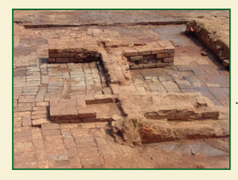
A portion of brick floor with a double hearth fireplace.

Fort Hawkins is listed on the National Register of Historic Places, funds managed by the Community Foundation of Central Georgia and Administered by the Fort Hawkins Commission.